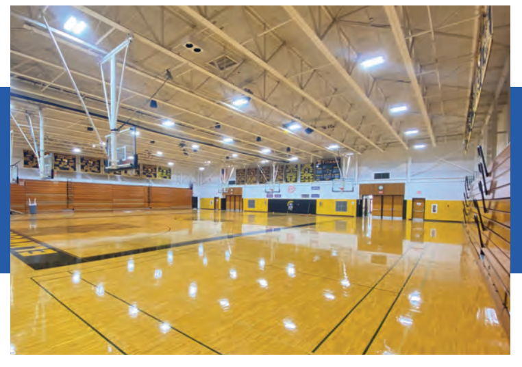
High School Gymnasium LED Lighting with customized scene controls

We work with you to design and quote your project. Then you can utilize one of our two approved procurement programs through OCEPC to implement the work: