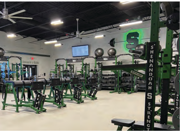
Design Build construction of new Weight Room