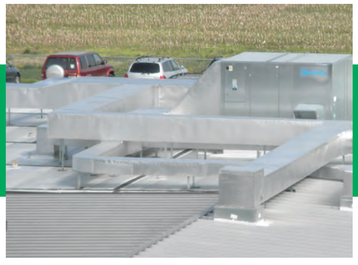
Mechanical upgrades including Energy Recovery Unit to condition outside air