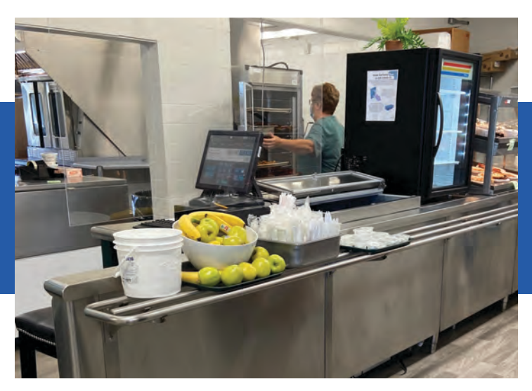
Kitchen renovations including flooring, painting, and all new kitchen equipment