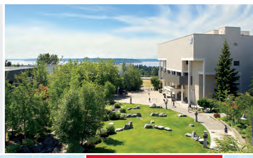
We make buildings work better.