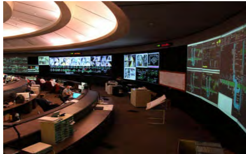
Command And Control