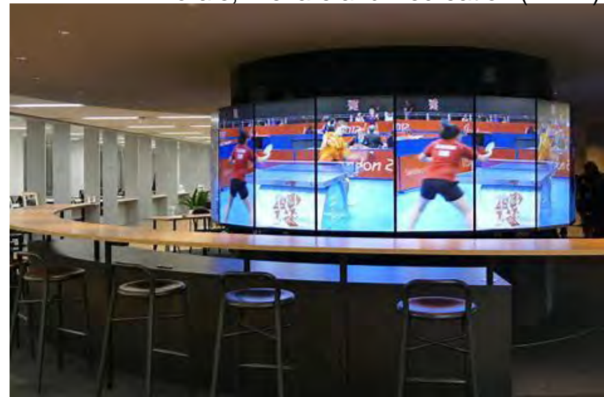
Morale, Welfare and Recreation (MWR)