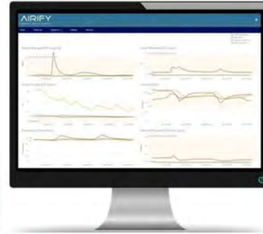
Airify Dashboard & Reporting