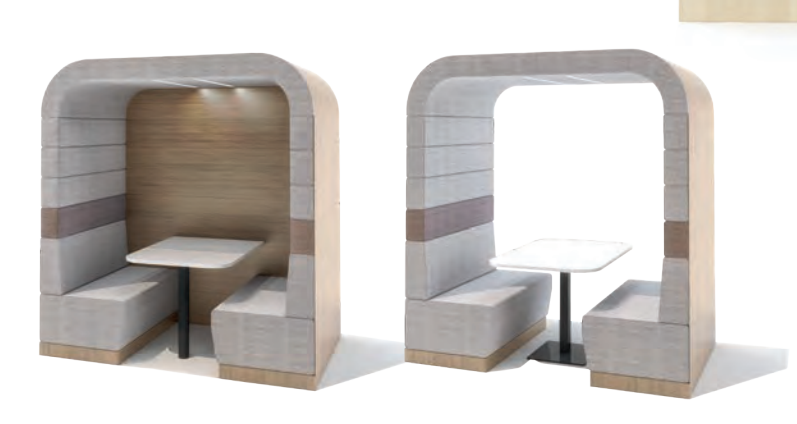
Available with or without rear wall.