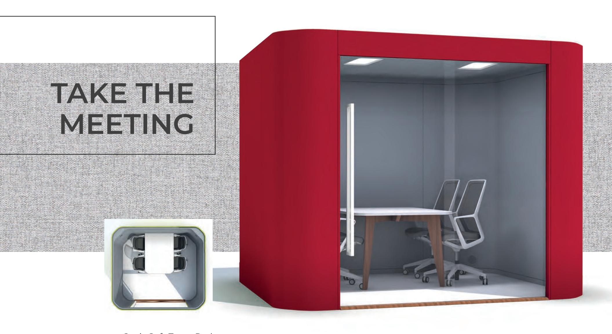
Oasis Soft Team Pod