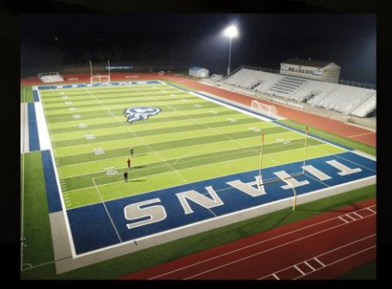
Lee's Summit West High School