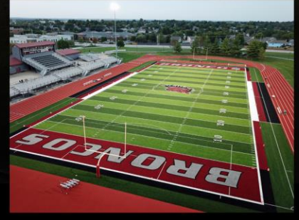
Lee's Summit North High School