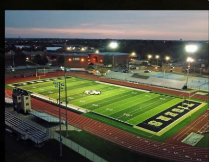
Lee's Summit High School