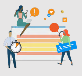
Web Filter Support