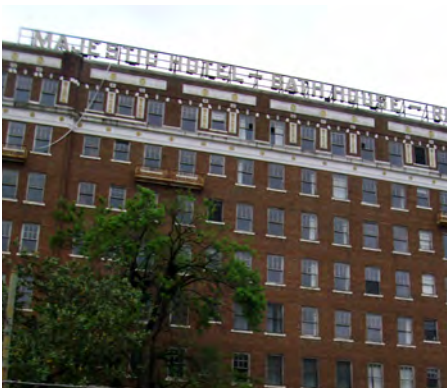
Majestic Hotel Hot Springs, Arkansas

Snyder Environmental's abatement services included the safe and compliant removal of Spray-Applied Acoustical Ceiling Texture, Flooring and Associated Mastic and TSI Pipe insulation, to ready the structure for demolition. Snyder maintained a crew of 15–22 abatement technicians for the duration of the project and completed the project just under two full months ahead schedule with no issue.