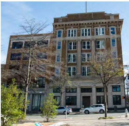
Exchange Bank Building Little Rock, Arkansas