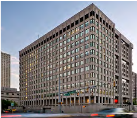
Vasco A. Smith, Jr. Administrative Building Memphis, Tennessee

Snyder Environmental's abatement services included the complete abatement of 9 floors and the basement of the occupied Shelby County Administrative Building in Memphis, Tennessee which housed all County Government Offices. The project was completed in phases as the county would vacate one floor at a time. The County offices on floors below and above the vacated floors remained fully occupied and functional, so all abatement work was completed after hours. Snyder completed each phase on schedule and with no interruption of County government operations.