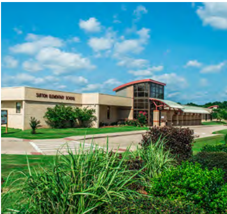
Fort Smith Public School System Fort Smith, Arkansas

Snyder Environmental has provided abatement services for school districts across the region. Our educational portfolio includes work in primary, secondary and higher education campuses. These projects range from small floor tile and mastic abatements to large renovations consisting of the abatement of thousands of feet of asbestos-containing ceiling material, fire-proofing, thermal pipe insulation, and transite. Snyder also provides the abatement of asbestos-containing built-up roofing systems, resilient floor coverings, and HVAC insulation. In addition, we work closely with facility managers to ensure the seamless coordination of subcontractors in the roofing, flooring, HVAC, and electrical trades.