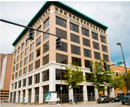
Mann on Main Little Rock, Arkansas