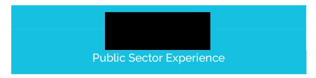
Table 1. Forefront Power Experience with Public Sector

We are proud to have worked with public sector partners across 23 states and over projects.