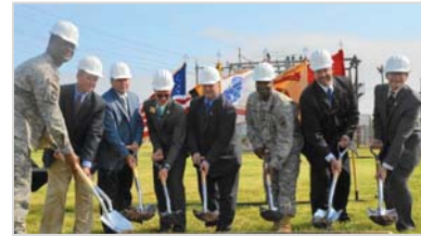
Breaking ground for the new natural gas cogeneration plant at Aberdeen Proving Ground. The plant will provide a substantial portion of the garrison's heating and power needs.

We recently completed design of a new natural gas cogeneration plant for the U.S. Army at Aberdeen Proving Ground (APG). This plant helps APG make significant progress toward energy resiliency, a critical mission for Army installments around the world.