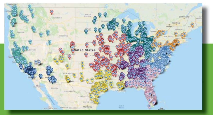
Unify's National Footprint

Houston . San Antonio . Beaumont . Denver