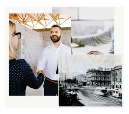
From 1894 to Today. We are Established and Growing with our Partners.