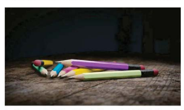
Texas will begin a program to test drinking water in thousands of elementary schools and child care facilities across the state.

Texas will begin a program to test drinking water in elementary schools and child care facilities across the state by 2024