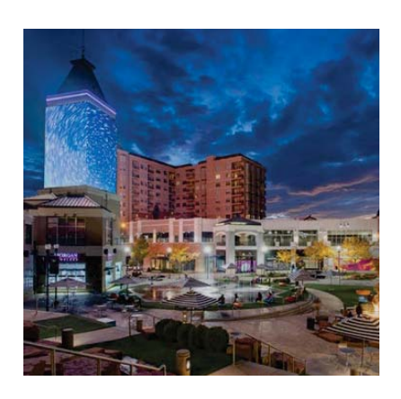
The Gateway, multi-use: Shopping, Restaurants, Hotel, Apartments/Condo, and Entertainment.