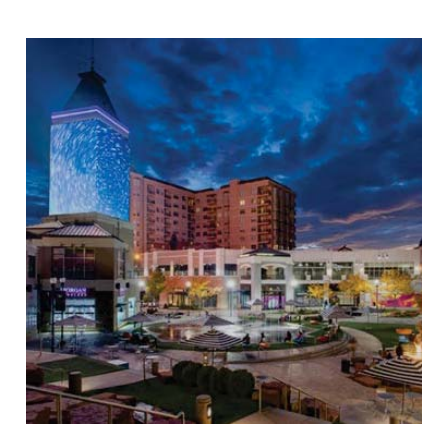
The Gateway, multi-use: Shopping, Restaurants, Hotel, Apartments/Condo, and Entertainment.