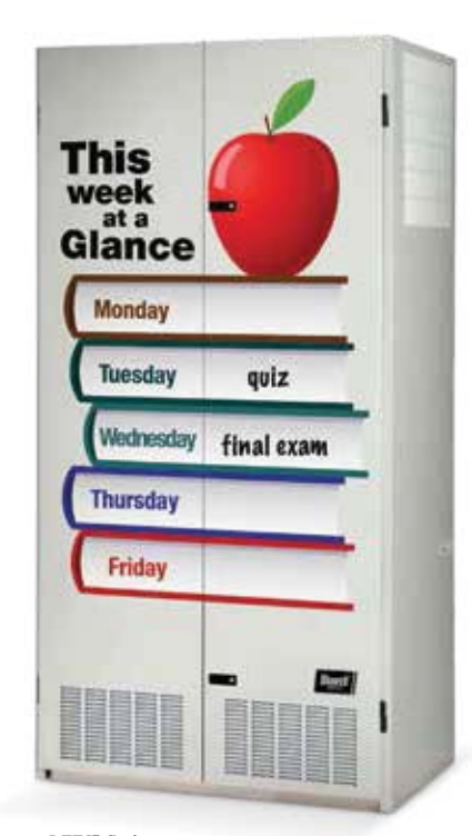
I-TEC® Series with graphic option