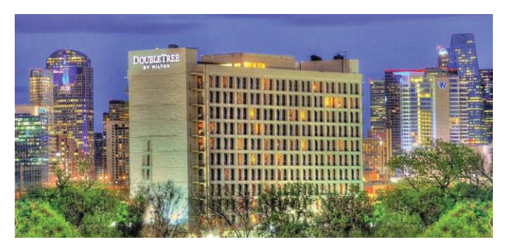
Year Completed 2016