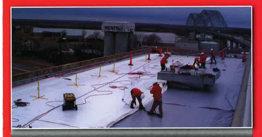
Memphis Cook Convention Center - Memphis, Tennessee