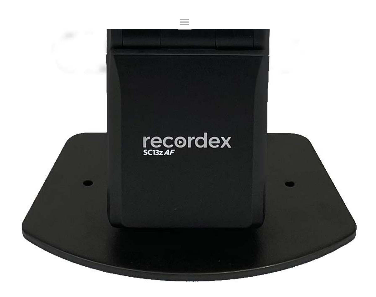
Want to learn more?