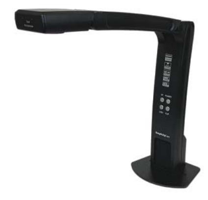
All cameras covered by a 5-year replacement warranty.