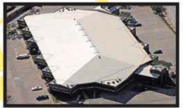
The Atrium - Flowermound, TX