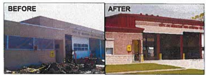
City of Houston Fire Station 29