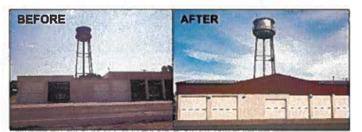
Pilot Point Fire Department