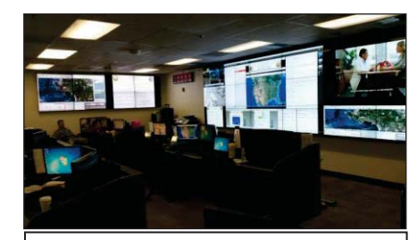
The 115th Fighter Wing can rely on E-Logic to design, install, program, integrate and manage its entire war room.

We understand that our customer needs are unique and require specific tailoring to meet current and future technology challenges.