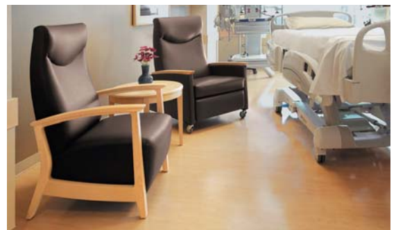
K1 — AtlaniCare Collection

When you work with NBF, you can expect our responsive team to be in constant communication with you, allowing you to rest easy while we handle the details. From space planning and product selection to final approval and installation, we'll be there every step of the way. We're here to help you transform your healthcare facility into a space for healing.