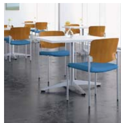
Cafeteria & Dining