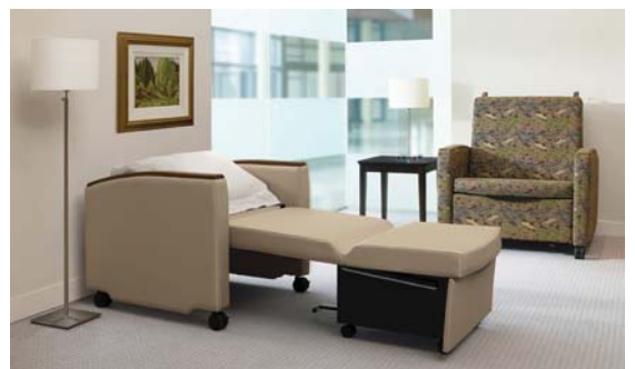
GlobalCare — At-Eez Collection