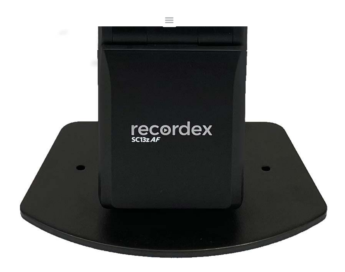
Want to learn more?