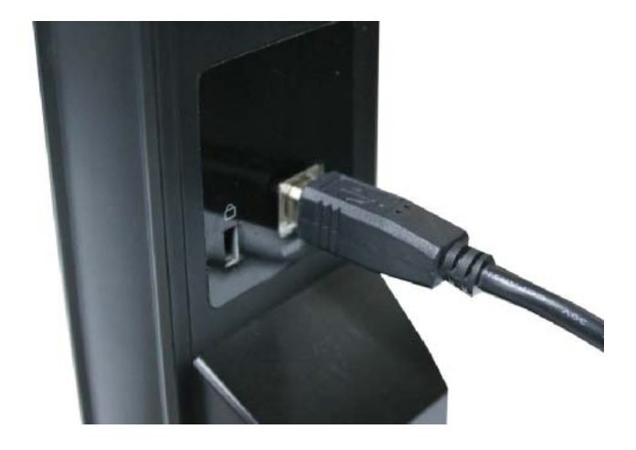
Designed to save space and move with you

With a sleek fold down design, the SimplicityCam document camera can be left on the desk. Close it down to a small 6×6 footprint to give yourself some space. When you're ready, just flip it back up and present. And with a weight of only 3 pounds, the camera can be carried without slowing you down.