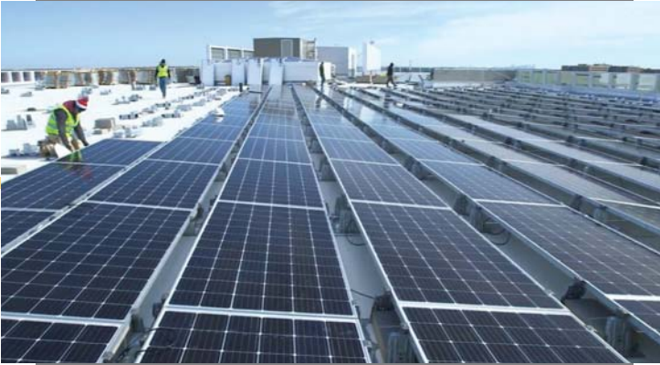
American Airlines Credit Union