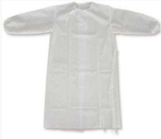
WANJIE Level 1 Isolation Gown