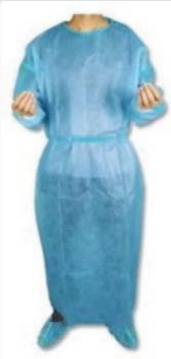
ANGELINE Level 2 Disposable Isolation Gown