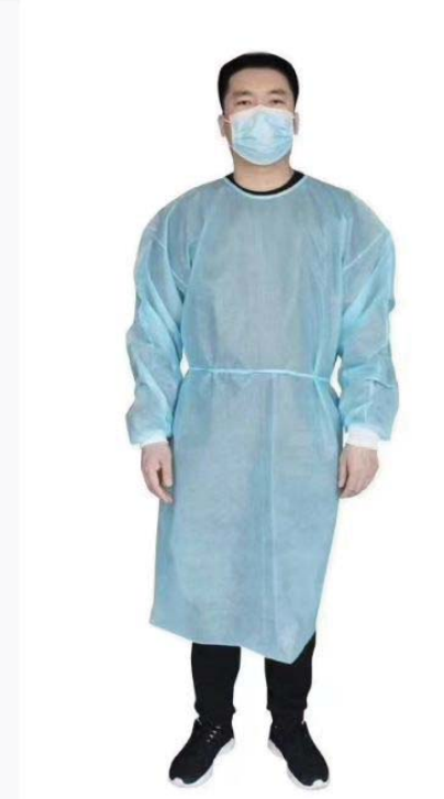
XINLE HUABAO Level 3 Disposable Isolation Gown