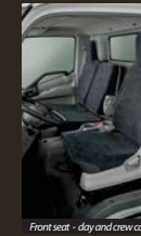
Front seat - day and crew cab