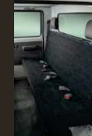
Rear seat - crew cab