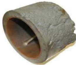
Worn out wheels