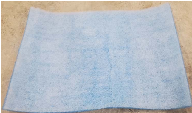
Figure 2 MERV 8 1" filter pad.