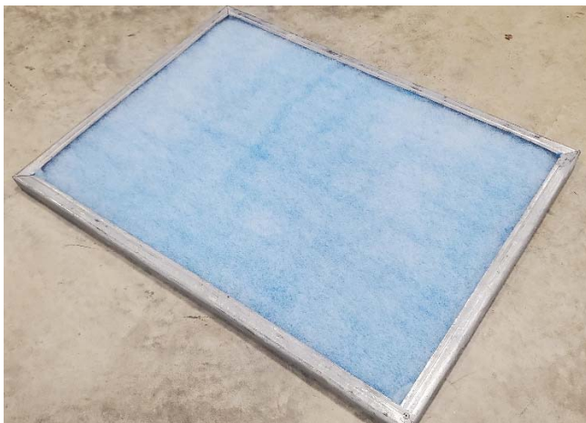
Figure 3 Filter frame and media.