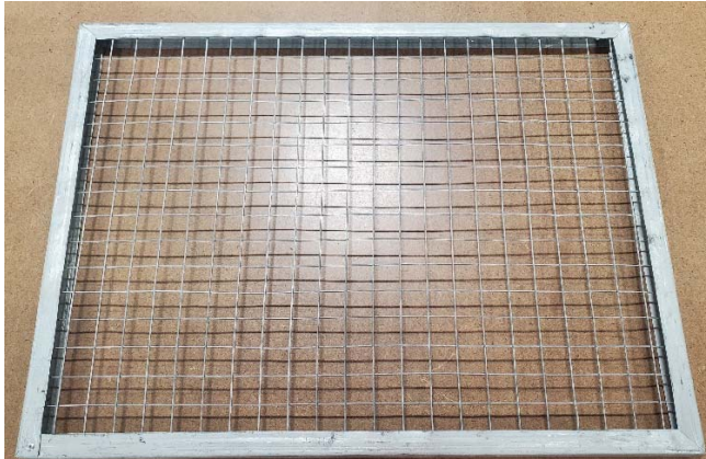
Figure 1 Example of custom metal frame.

S&W also offers a regularly scheduled filter changing service