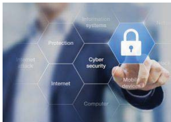
SMG Experts Can Help With Your Network Security!

In today's digitally-connected world, network security is more important than ever before. If your business doesn't have a powerful internet security plan in place, you could be vulnerable to a costly attack.