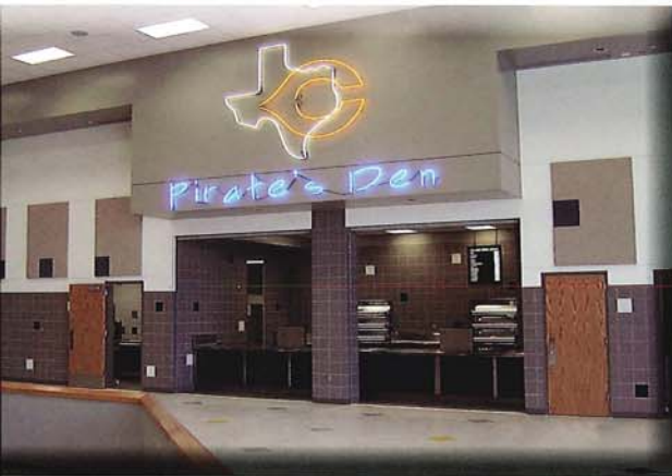
Crandall High School

Elementary, Intermediate and High Schools