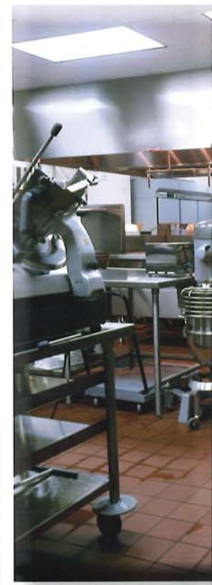
Baptist Memorial Hospital