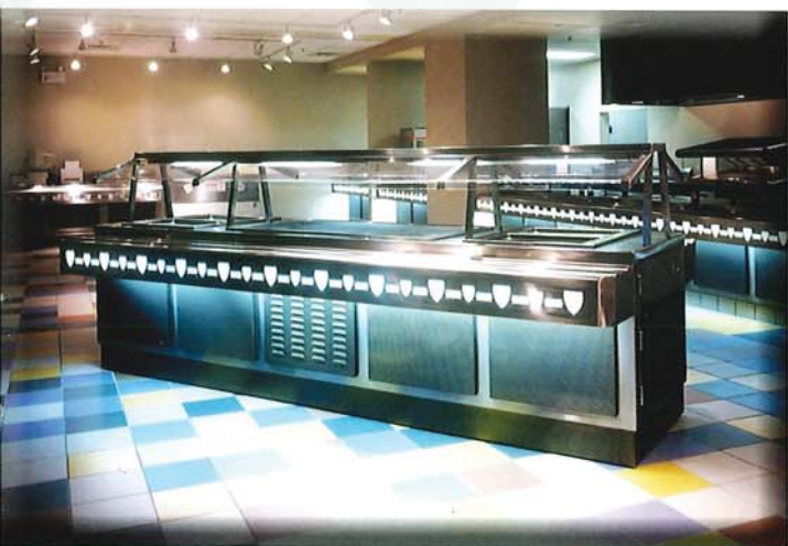
Episcopal Collegiate School