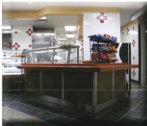
Shepton High School