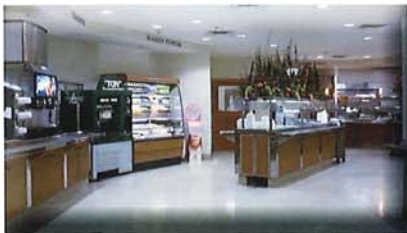
Baptist Memorial Hospital