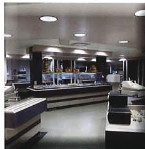
Jefferson Regional Medical Center

Garland, KolPak/McCall, Frymaster and many