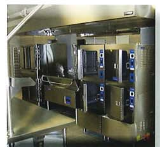
Crandall High School