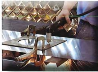
Supreme Fixture Company