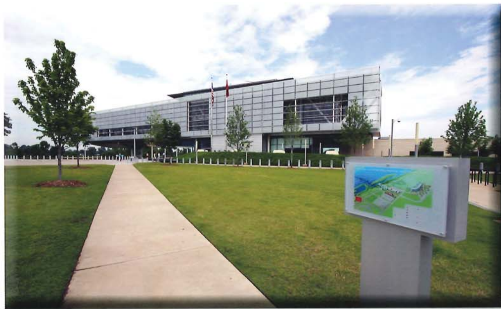
Clinton Presidential Library