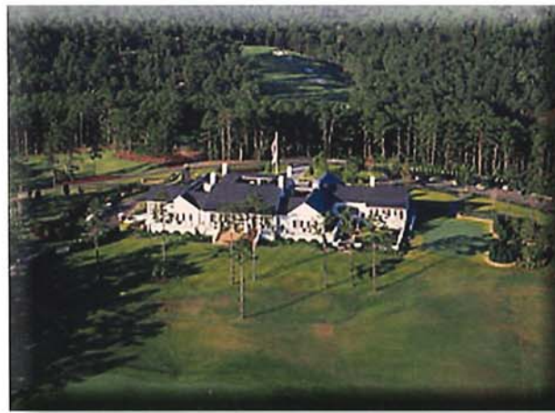
Alotian Country Club - Clubhouse