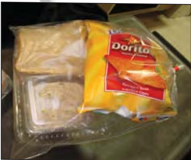
Sack Lunch: Sandwich, Chips and Desert