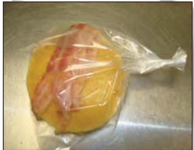
Pancake with Bacon