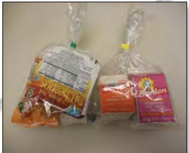
Breakfast in a Bag: Cereal and Milk