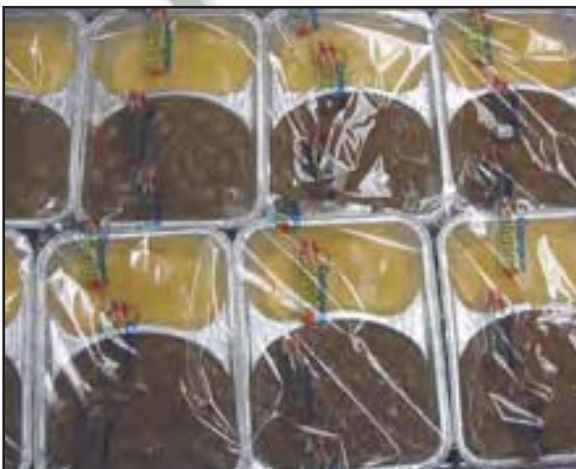
Chilli and Cheese Bagged for Nachos