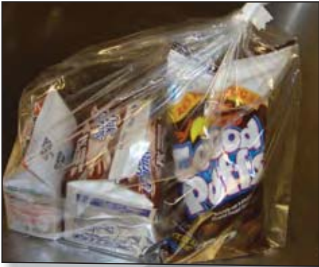
Breakfast in a Bag: Cereal and Milk