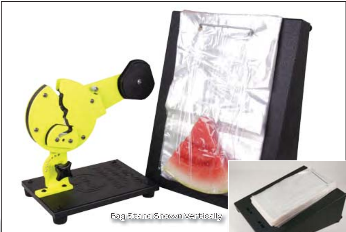
Bag Stand Shown Vertically