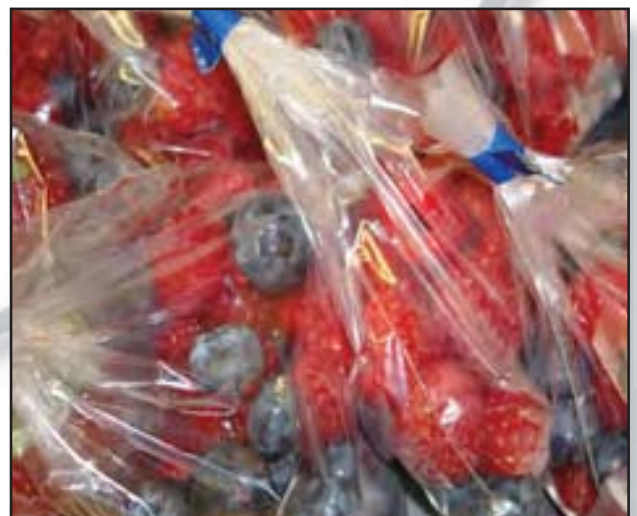
Blueberries and Raspberries