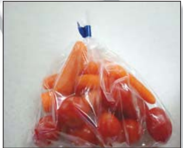
Carrots and Tomatoes