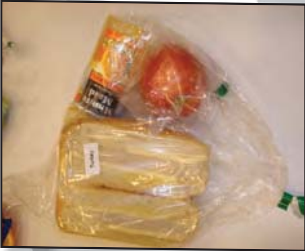
Sack Lunch: Sandwich, Apple and Drink