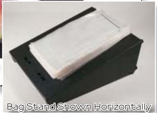
Bag Stand Shown Horizontally

With a quick downward motion, our heavy duty tape sealer will have your bags sealed easier than you could imagine. Pull the bag out at that point to leave the excess bag or you can choose to pull back on the end of the bag and cut the excess for a nicer presentation. After a few minutes of practice anyone can become proficient.