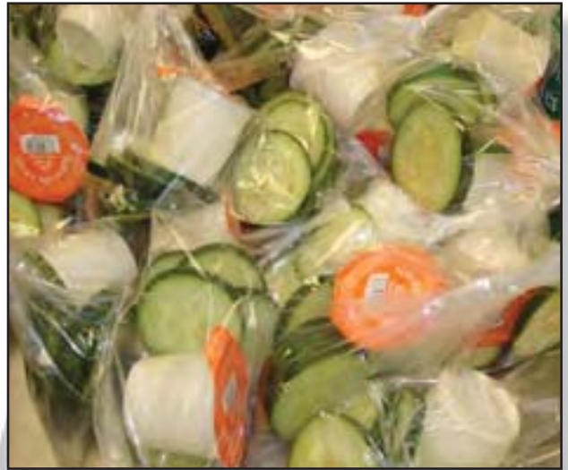
Cucumbers and Dressing