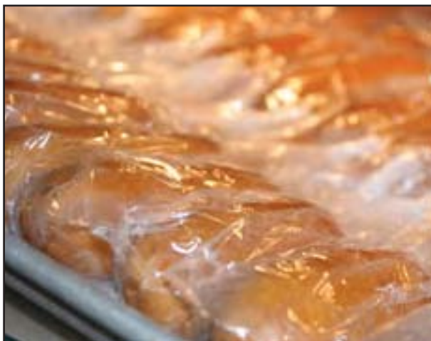
Breakfast on a Stick