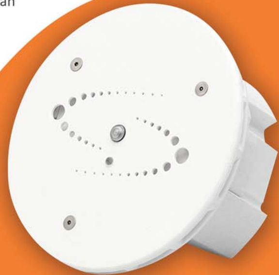
*HALO IOT Smart Sensor - Patent Pending*

With HALO, security staff can now monitor areas where cameras are not allowed. Staff can get these alerts through the web or traditional burglar, video management systems, access control or building management tools.