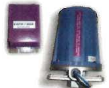
HONEYWELL FLAME SAFEGUARD AND AMPLIFIERS