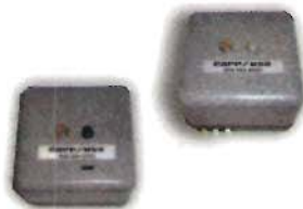
HONEYWELL FLAME RELAYS

WE REPAIR THOUSANDS OF ITEMS AND HUNDREDS OF MANUFACTURERS CALL FOR PRICING AND AVAILABILITY