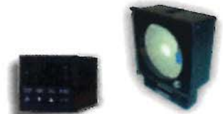
RECORDERS AND UDC'S