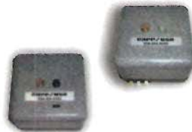
HONEYWELL FLAME RELAYS

WE REPAIR THOUSANDS OF ITEMS AND HUNDREDS OF MANUFACTURERS CALL FOR PRICING AND AVAILABILITY