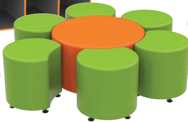
Sonik® Flower Soft Seating Set