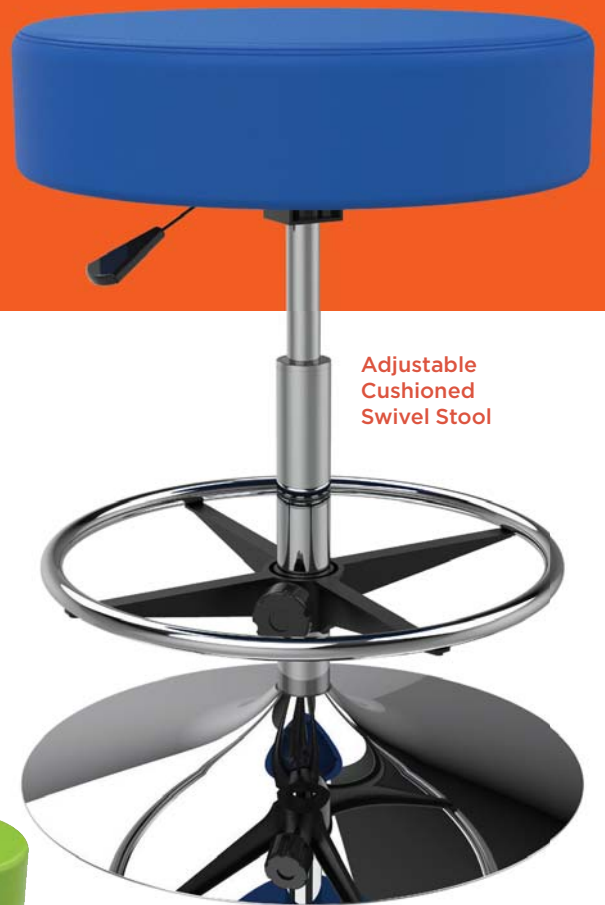
Adjustable Cushioned Swivel Stool