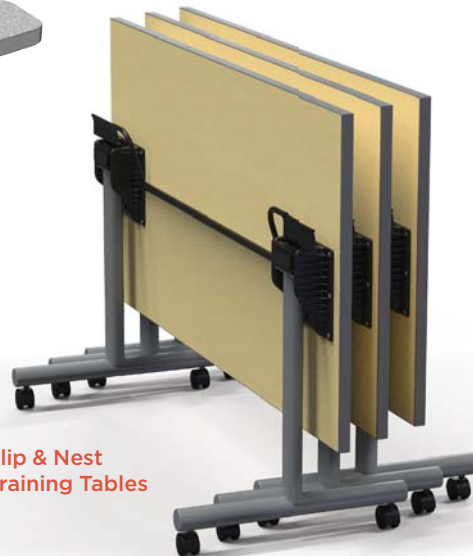
Flip & Nest Training Tables

At Marco Group, we continue to design and develop innovative products to add to our assortment. This year is no exception. We have added an assortment of new items designed to meet the needs of today's classrooms, libraries and more. To learn more about our new products, please visit us online at www.marcogroupinc.com .