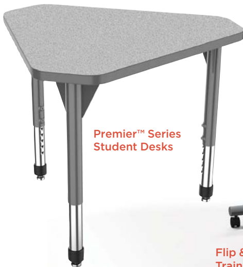
Premier™ Series Student Desks