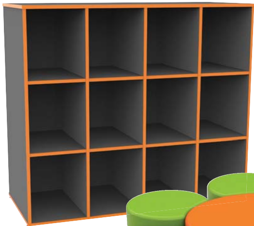
12-Cubbie Storage Cabinet