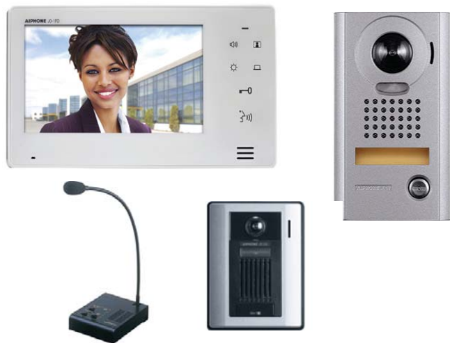
Protecting Life & Property