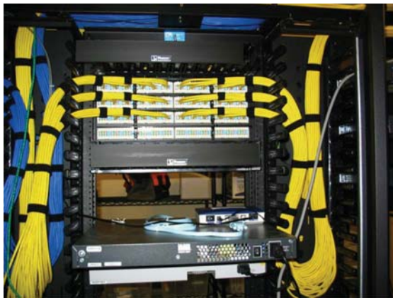
Protecting Life & Property

The type of emergency no longer matters: fire, terroristic threat level, or weather, MNEC systems will be used. NFPA is currently working to standardize the use and installation of MNEC to take over all other means of notification. MNEC uses multiple forms of communication such as email, phone, SMS, voice notification via PA systems, fire alarm systems, message boards, etc. It is not about making noise, but communicating an effective message to make an informed decision with intelligent voice. Edwards is the leader in MNEC technology - Intelligent Devices, Intelligent Design.