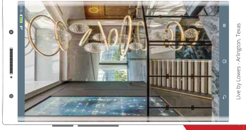
Live by Lowes - Arlington, Texas

Non-Structural Demolition Joint Sealers Gypsum Board Doors/Frames/Hardware Rough Carpentry Drywall Wall Coverings Fire Stopping Insulation Acoustical Ceilings