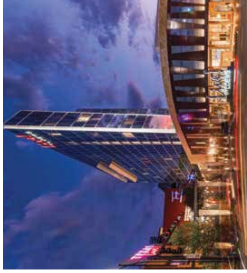
Texas Live! - Arlington, Texas

Our in-depth knowledge of task-related labor needs, product choices and availability, and market fluctuations have been able to make a huge impact on our projects.