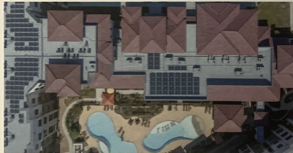
Villas at the Rim - Completed 2019