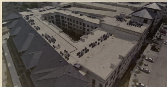
Domain at the Gate - Completed 2019