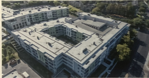
Edison Apartments - Completed 2019