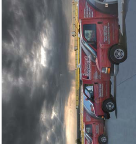
24/7 Service and Repair