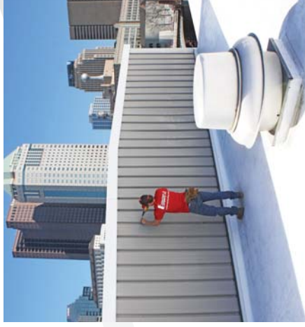
ES1 Certified Sheet Metal Shop

Industry Leading EMR and Nationwide Quality Award Winner.