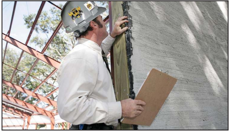
INSPECTIONS AND PREVENTATIVE MAINTENANCE