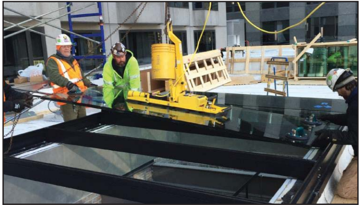
SKYLIGHT REPLACEMENT AND REPAIR