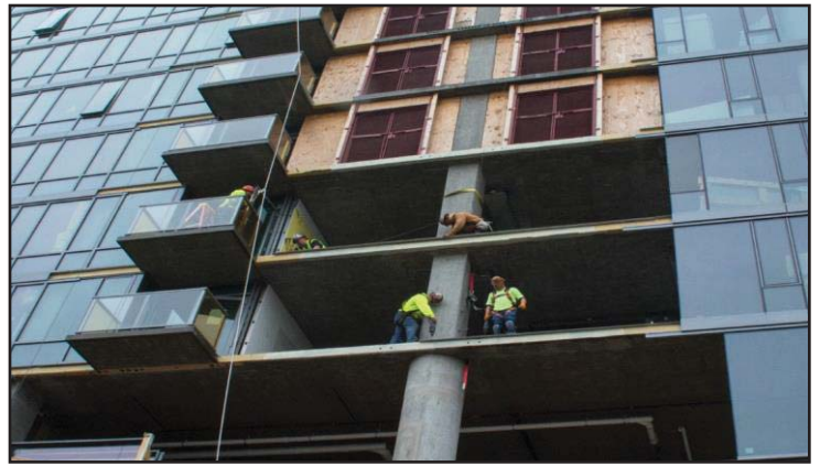
HIGH-RISE WINDOW REPAIR AND REPLACEMENT