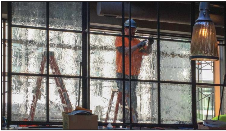
DECORATIVE AND SPECIALTY GLASS