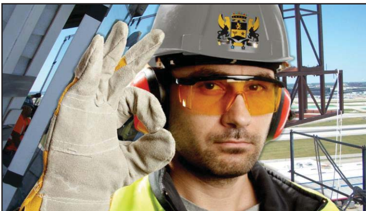
.69 EMR SAFETY RATING