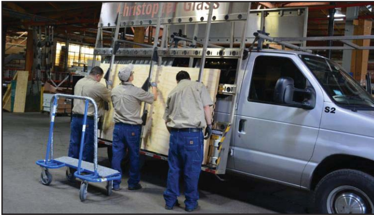
24/7/365 EMERGENCY BOARD UP SERVICES