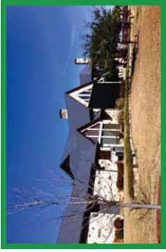
Metal Shingles, Sulphur Springs, TX