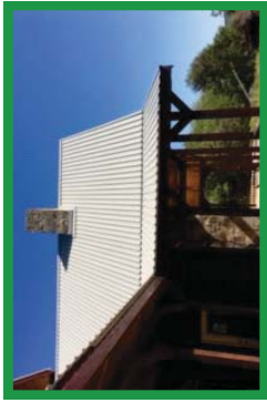
Metal Roof, Corsicana TX