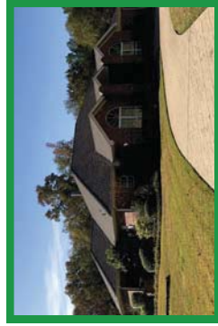
Architectural Shingles, Longview TX