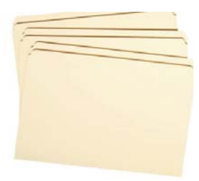
Acid free Folders Legal, Full cut Top Tab