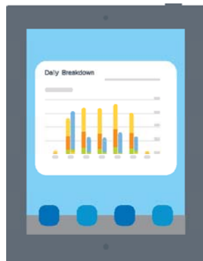
Jive’s full call accounting system is accessible through the browser-based administrator portal.