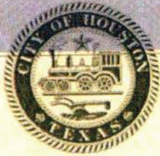
Sylvester Turner, Mayor