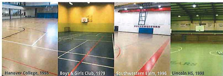
Hanover College, 1995