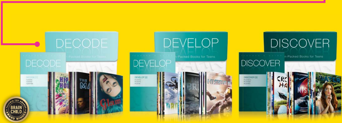
Teen Emergent Reader Libraries® Phonics