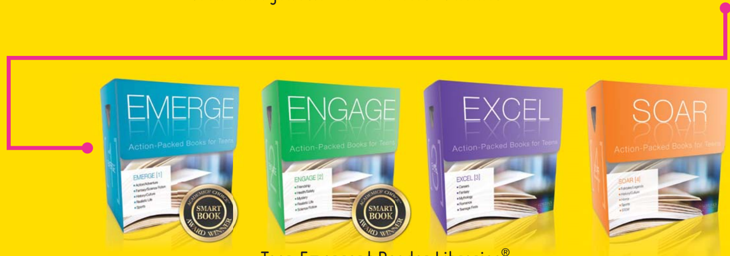
Teen Emergent Reader Libraries®