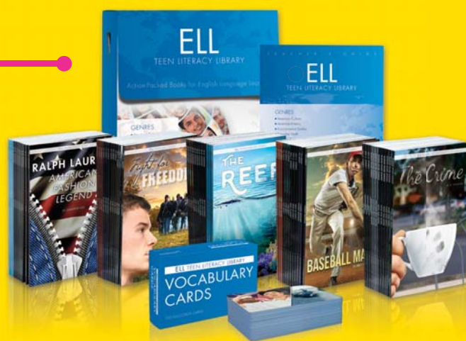
ELL Teen Literacy Library