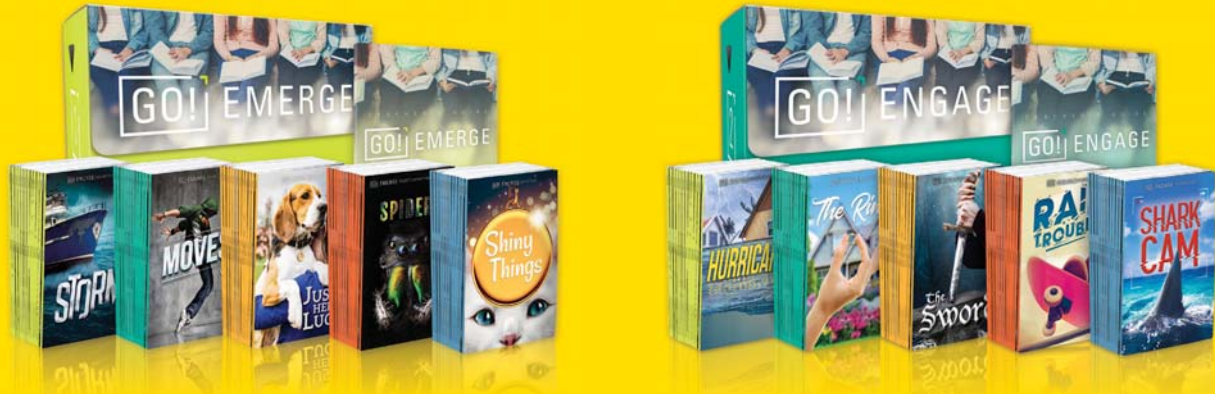
Tween Emergent Reader Libraries