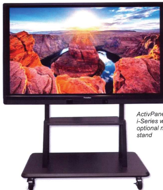
ActivPanel i-Series with optional mobile stand

Available in either a 65" 1080p HD or 75" 4K Ultra HD models, there's an i-Series panel to fit every budget!