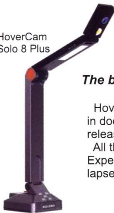
HoverCam Solo 8 Plus