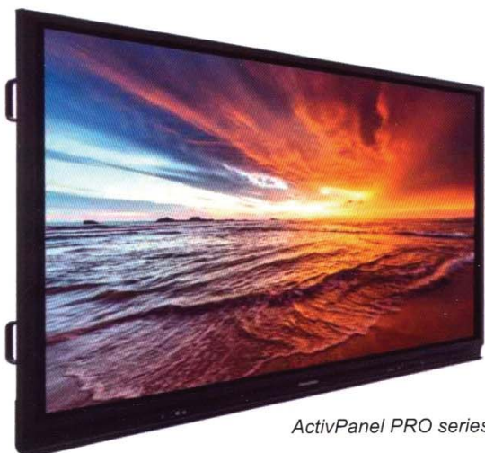
ActivPanel PRO series

Utilizing In-Glass Touch technology, the 20 points of touch are the most responsive and accurate in the market today. Three combinations of sizes and displays (70" 1080p HD, 75" and 86" 4K Ultra HD) makes it easy to find just the right ActivPanel for you!