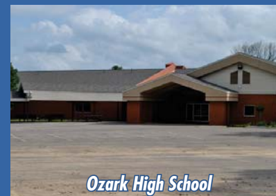
Ozark High School