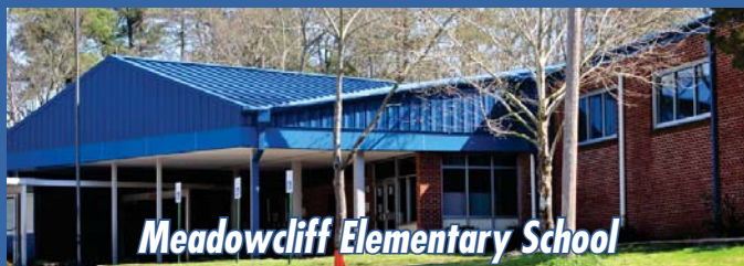
Meadowcliff Elementary School

Can I install a Metal Roof over my existing roof? Yes. Because of the light weight of the metal, it is easily installed over existing roofing materials without the disposal problems commonly associated with re-roofing projects.