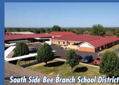
South Side Bee Branch School District

Will it look good? Freedom Roofing can turn your flat roof into a pitched roof by fabricating on site a light gauge metal framing system. Freedom Roofing specializes in on-site roll forming of our metal panels. On-site roll forming has several distinct advantages verses ordering pre-made panels from a manufacturer.