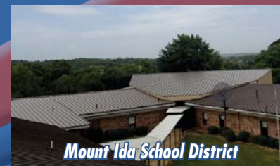
Mount Ida School District