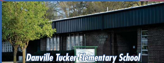
Danville Tucker Elementary School

Will it cost more than conventional roofing? Although the initial cost of metal is higher, the life-cycle costs are significantly lower than conventional materials. A metal roof will provide years of low maintenance service. Freedom Roofing metal panels are formed from a 24 gauge galvalume substrate and have a Kynar finish applied from a wide color selection. The Kynar finish will provide a 25 year color warranty with most available colors.