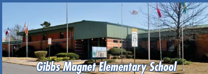
Gibbs Magnet Elementary School

Can I install a Metal Roof over my existing roof? Yes. Because of the light weight of the metal, it is easily installed over existing roofing materials without the disposal problems commonly associated with re-roofing projects.