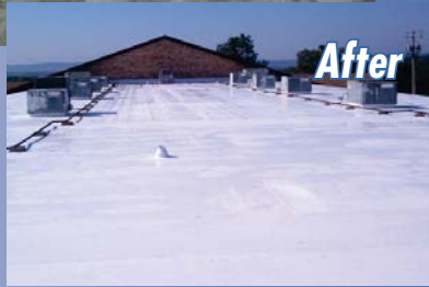
North Heights Church of Christ