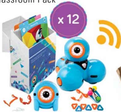
Dash and Dot Tech Center Pack