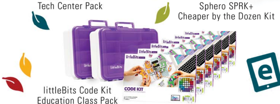
littleBits Code Kit Education Class Pack

Call 1 (877) 252-0001 | Mail sales@eduporium.com Visit www.eduporium.com