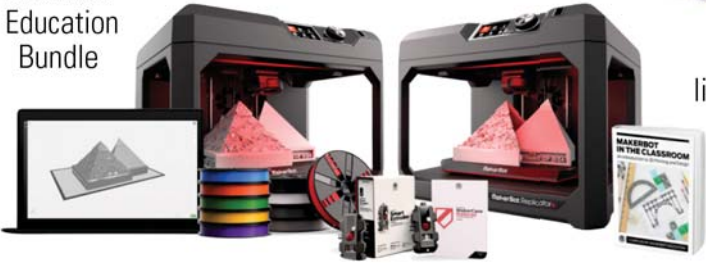
Makerbot Education Bundle

Classroom packs help schools reduce the cost of EdTech purchases, foster a more inclusive classroom environment, and ensure meaningful collaboration among students. Each kit we offer provides students with a progressive approach to mastering specific STEM skills. Get yours at www.eduporium.com .