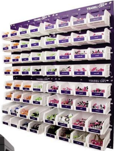
littleBits Pro Library with Storage