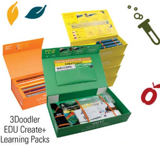
3Doodler EDU Create+ Learning Packs