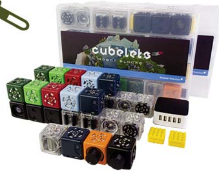
Cublets Creative Constructors Pack