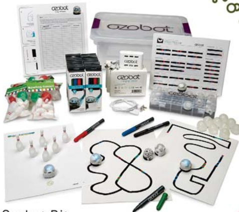
Ozobot Bit Classroom Pack