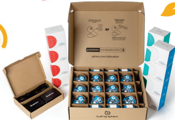
Sphero SPRK+ Cheaper by the Dozen Kit