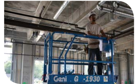
24/7 Lighting & Electrical Service