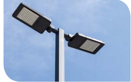
Green Product Supplier