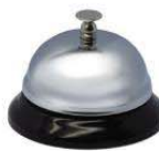
General Office Accessories