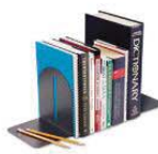
Desk Accessories & Workspace Organizers