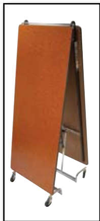
This is a short description of the above image.