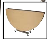
This is a short description of the above image.