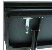
This is a short description of the above image.