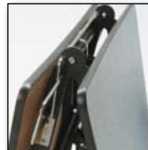
Locks: Unique dual-purpose lock holds table securely in both up and down position. It is easily reached from both sides of the table.