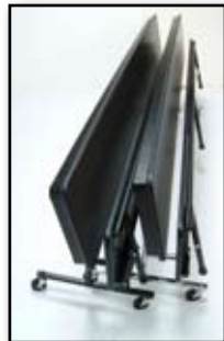
This is a short description of the above image.