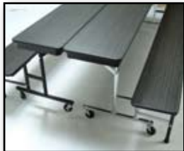
This is a short description of the above image.