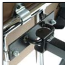
This is a short description of the above image.