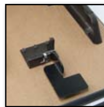
This is a short description of the above image.