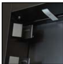
This is a short description of the above image.