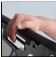
This is a short description of the above image.