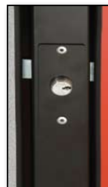
This is a short description of the above image.