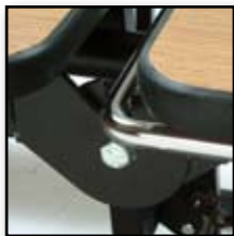
This is a short description of the above image.