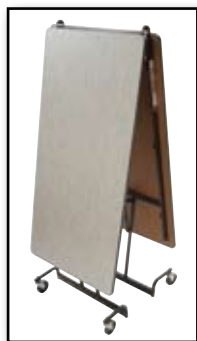
This is a short description of the above image.