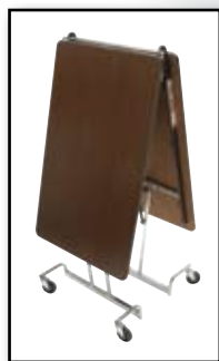
This is a short description of the above image.