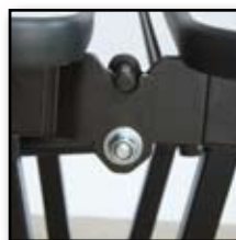
This is a short description of the above image.