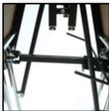
This is a short description of the above image.