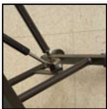
This is a short description of the above image.