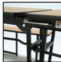
This is a short description of the above image.