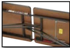
This is a short description of the above image.