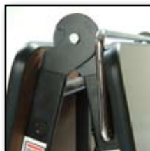
This is a short description of the above image.