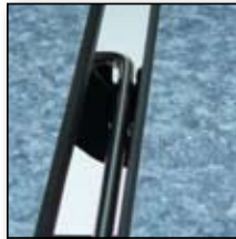
This is a short description of the above image.

This table's unique shape provides more seating in the same area than conventional tables and chairs. It rolls through standard doors in its storage position. End legs and center bench supports are nickel-chrome. All other metal parts are powder coated midnight-brown.